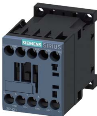
Contactor relay, 2 NO + 2 NC, 125 V DC, Size S00, screw terminal